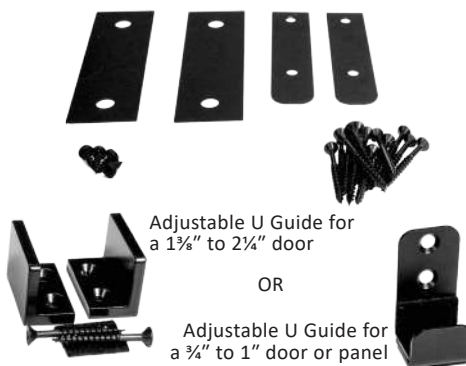
Adjustable U Guide for a 1 \frac{3}{8} " to 2 \frac{1}{4} " door

Wrap almost any door or panel material in powder-coated steel!