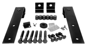
Standard Series J-strap hardware set

Our MP Series barn door hardware is ideal for construction and remodeling projects in apartment complexes, hotels and office buildings. Or use it anywhere cost is a concern and customization options are less of a priority.