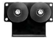
Double Roller Hanger