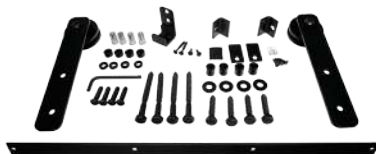
Shutter Series straight strap hardware set with track