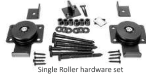
Single Roller hardware set

With our Hidden Roller Series barn door hardware, your door almost appears to float in midair! The secret is our new roller hanger design that mounts out-of-sight on the back of the door. With no visible mounting straps or rollers, all you see from typical viewing angles is the exposed half of the track, for a clean, contemporary style.