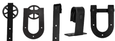
Five Hanger Styles