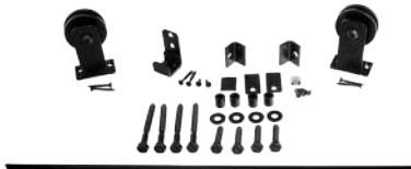
Shutter Series top mount hardware set with track