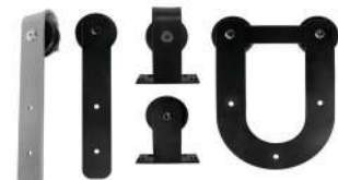
Five Hanger Styles